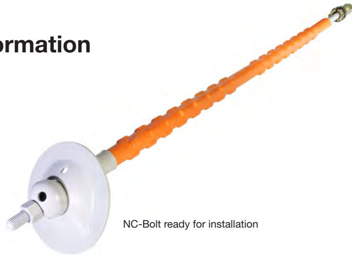
NC-Bolt ready for installation