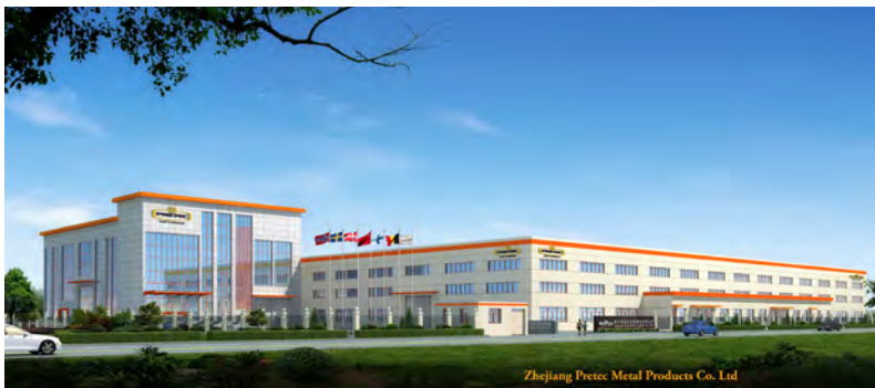
Factory in Haining, Zhejiang, China. Total area: 22000 m2. Content: mechanical production, hot dip galvanizing and powder coating.

We produce two types of combination bolts - NC-Bolt (rebar bolt) and Pc-Bolt™(tube bolt). Product data sheets and brochures for both bolt types can be downloaded from www.pretec.se