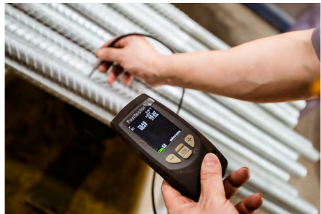
Control of coating thickness