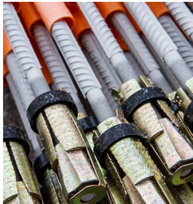
Nc-bolts with mounted expansion shells