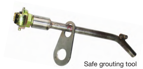
Safe grouting tool

To ensure proper and safe grouting, the safe Pretec grouting tool is recommended. Option for quick grouting is also available.