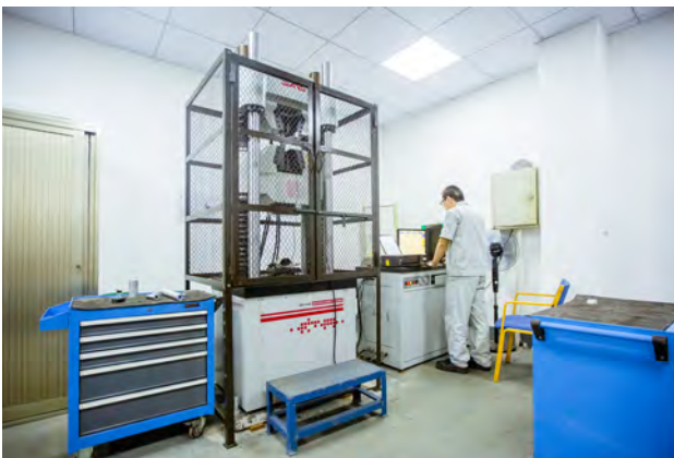
Pretec China laboratory