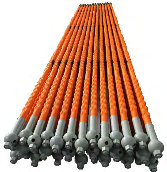
NC-Bolts packed on pallet.