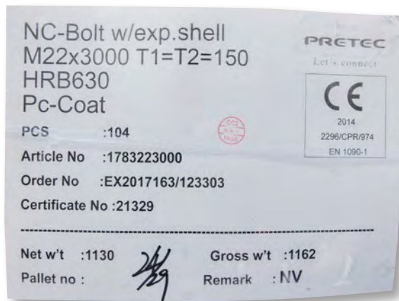
Standard label marked with certificate number

Certificates in compliance with EN 10204 3.1 are available for inspection. Approvals for bolts from the Norwegian Public Road Administration and Bane NOR (Norwegian Railway Authority) for use in Norwegian infrastructure tunnels are available on request.