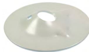
Spherical bearing plate

Due to superior design, the expansion shell will provide immediate anchoring effect when the bolt has been installed and tensioned.